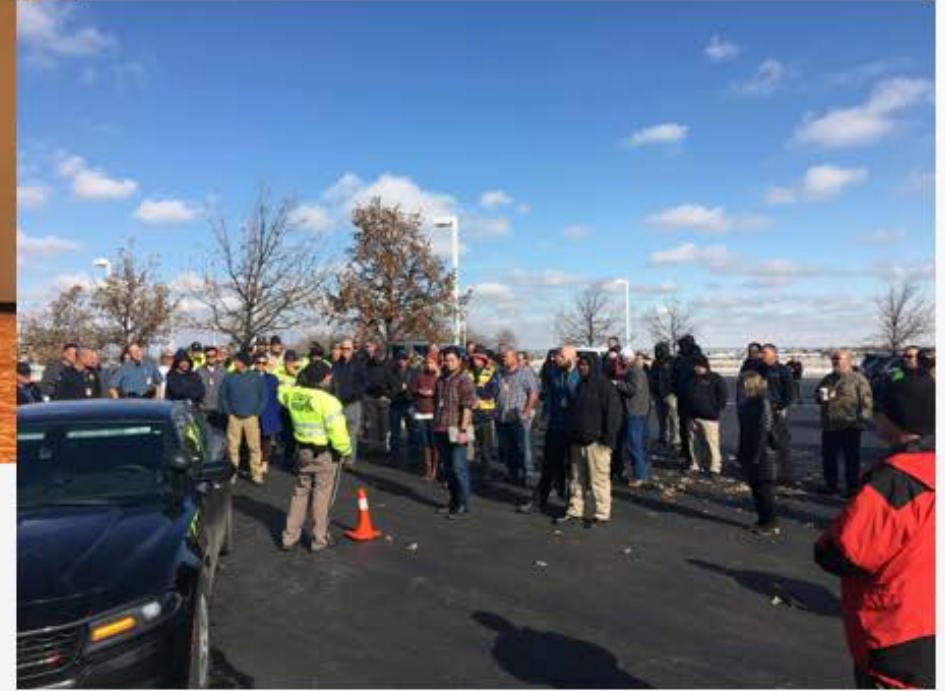
Embassy Suites – Loveland Colorado